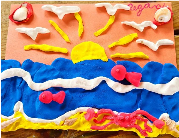
Model Magic Beach Scene

Summer Camp ended on August 4, 2023 at Pat Livezey Park with a great magic show, game day with prizes, and a “Pizza Day Party”. Planning will begin in January for the 2024 camp season. And as usual, some great art projects by our young campers!