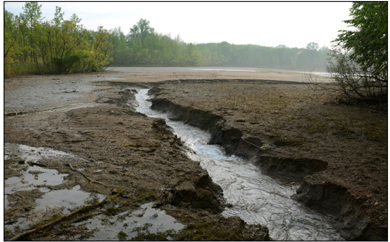
AQUETONG CREEK UNLEASHED: Fed by the powerful coldwater spring (which, in the perspective of the photo, is located behind the viewer), Aquetong Creek cuts decisively across the newly drained lake bed. It flows east, then south, in this early part of its journey to the Delaware River, as it independently establishes its new course as a stream.

Meanwhile, what remains of the breached dam will point to the fact that the headwaters powered a mill and supported a fish hatchery throughout much of the 19th and 20th centuries. 🌿