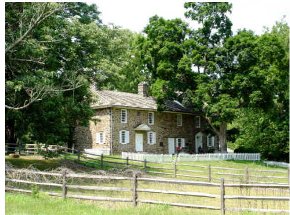
Washington Crossing State Park Thompson-Neely “House of Decision”

Washington Crossing Historic Park, owned by the Pennsylvania Historical and Museum Commission, is located along the Delaware River at the border of Solebury and Upper Makefield Townships. The park is roughly bisected by Route 32, with 220.5-acres lying within Solebury Township. Special amenities include the Historic Thompson-Neely “House of Decision”, Bowman’s Hill Wildflower Preserve, Bowman’s Hill Tower, and the American Revolutionary Soldiers Gravesite. Hiking trails, restrooms, pavilions / picnic areas and ample parking are available throughout the park. Nature study, historic interpretation and hiking / walking are the most common recreational activities at this site.