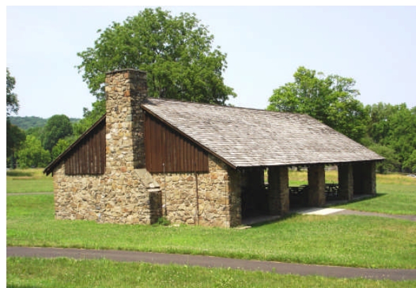
Washington Crossing State Park Pavilion