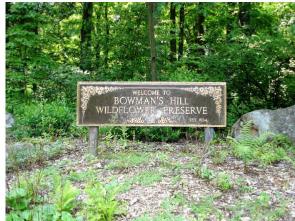
Bowman’s Hill Wildflower Preserve