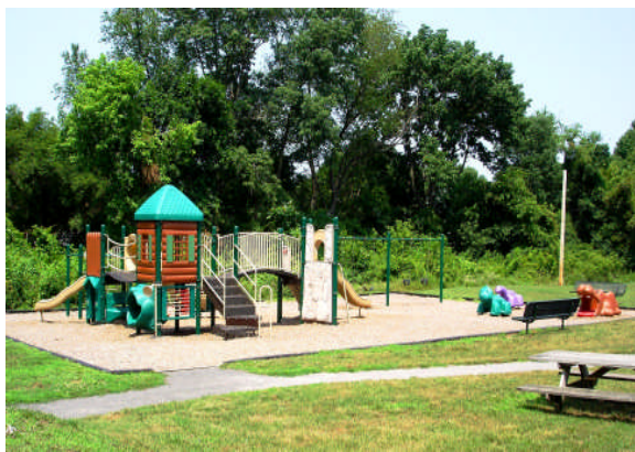
Pat Livezey Park Playground

Silver Tail Lane, the primary roadway within the Fox Run Preserve age-restricted residential development "dead-ends" at the southwest boundary of the park with a gravel, circular turn-around just inside the park property. Ownership of Silver Tail Lane was turned over to Solebury in order to provide access to the park and thereby satisfy the developer's parks and recreation requirements.