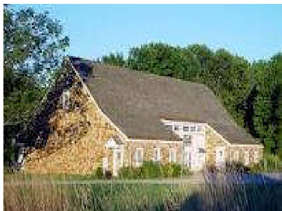
Honey Hollow Environmental Education Center