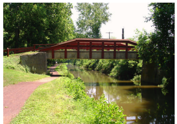
Delaware Canal State Park

Delaware Canal State Park also contains the Virginia Forrest Recreation Area, which is located on the east side of Route 32 near Laurel Road and features canoe access to the Canal and River, restrooms, a picnic area and ample vehicle parking.