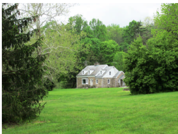
Historic "Judy House" at Ingham Spring