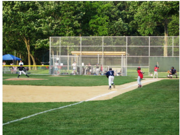
Laurel Park Little League Baseball Field

The community sports leagues utilize the fields for both practices and games from March through December. None of the playing fields have lights. Laurel Park also features a modern playground designed for children between the ages of 2 and 12. The Township has prepared a master plan for this site and leases a portion of the New Hope-Solebury school district property, via an Intergovernmental Agreement signed in 2006, for parking and for part of the multi-purpose football/soccer field.