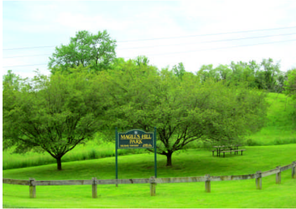
Magill's Hill Park