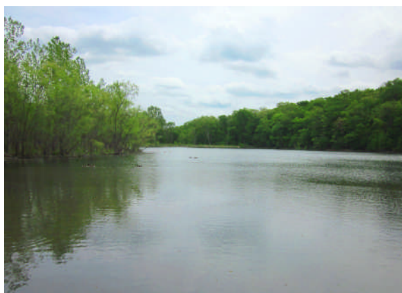
Aquetong Lake at Ingham Spring