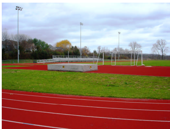
Track Facility at New Hope-Solebury High School