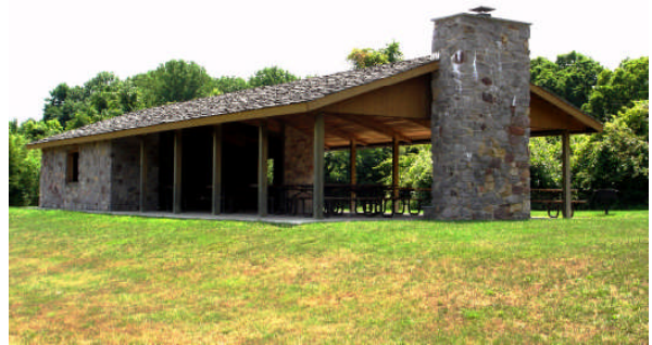
Pat Livezey Park Open Air Pavilion

Located along Upper Mountain Road and Street Road, the site contains 80-acres of undeveloped open fields, farmland and woods. The site was designated for future active and passive recreation use by the Township Board of Supervisors. A preliminary "concept plan" was prepared through a series of public meetings, and planning will continue in the future.