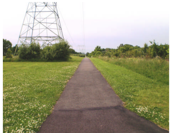
Solebury Township Trail