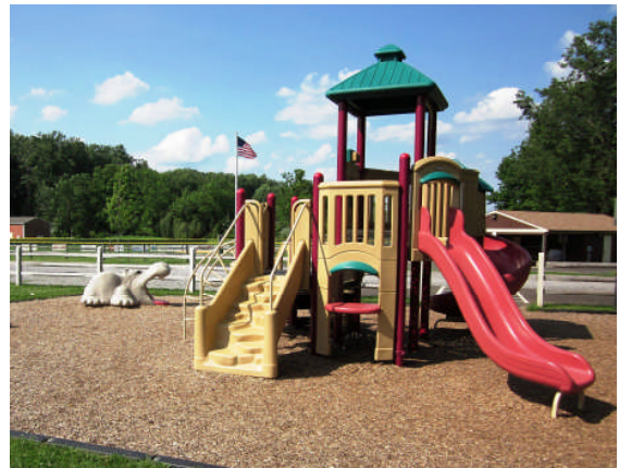
Laurel Park Playground