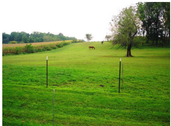
Solebury Park (Roeser Tract) 80 Acres of Undeveloped Land