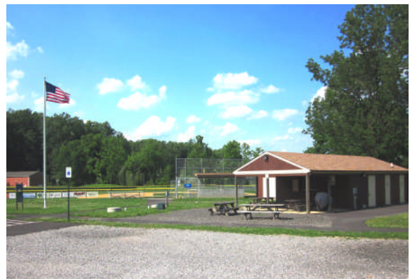
Laurel Park Snack Stand