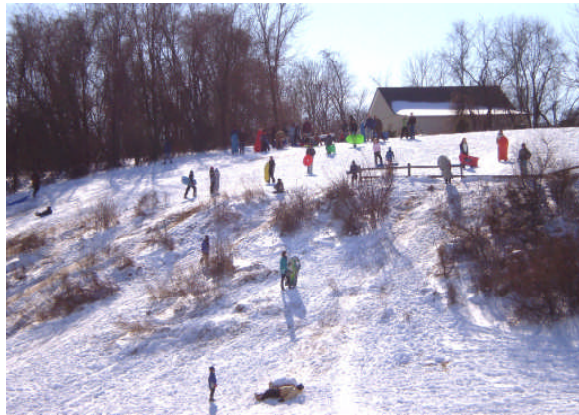
Winter at Magill's Hill Park

This property is a 30-acre portion of the 104-acre open space area acquired during development of the North Pointe residential community (located on the former Marshall Tract). This 104-acre site is located on the westerly side of Creekside Drive. Pedestrian access and parking to the open space area is provided in designated areas along Creekside Drive. The 30-acre tract that constitutes North Pointe Park was designated for active recreation use to satisfy the developer's parks and recreation requirements.