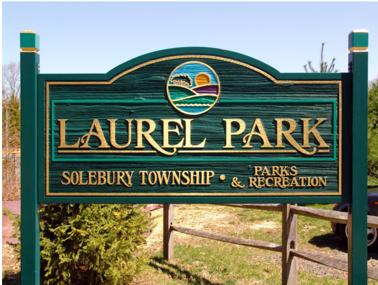
Laurel Park Entrance Sign