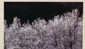
"Delaware River Winter"