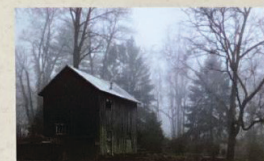
"Centre Bridge Canal"