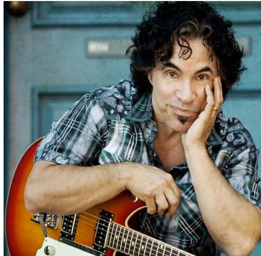
Rock-&-Roll-Hall-of-Famer John Oates

Winter Festival 2015 offers a V.I.P. ticket option that includes a "meet and