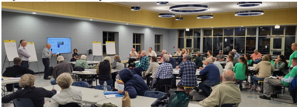
Over 40 residents participated in the Climate & Energy Forum, held at New Hope Solebury High School.

Presentation slides, break-out group notes, and supporting documentation, including the Rf100 Resolution and Energy Transition Plan, are available on the Township website.