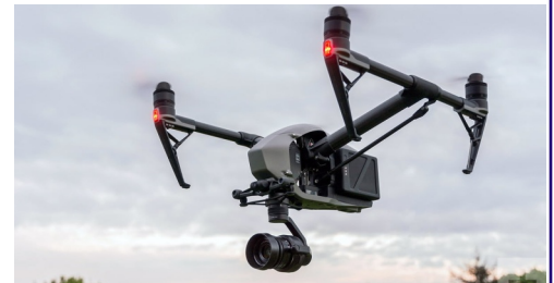
The DJI Inspire drone in flight, the same model in use for the deer survey.

Infrared drone surveys provide additional clarity to existing survey data, giving the Township a more robust picture of the deer population. The Raritan Valley Community College program has been conducting wildlife surveys for municipalities in central New Jersey for over 13 years and operates as a 501(c)3 non-profit organization.