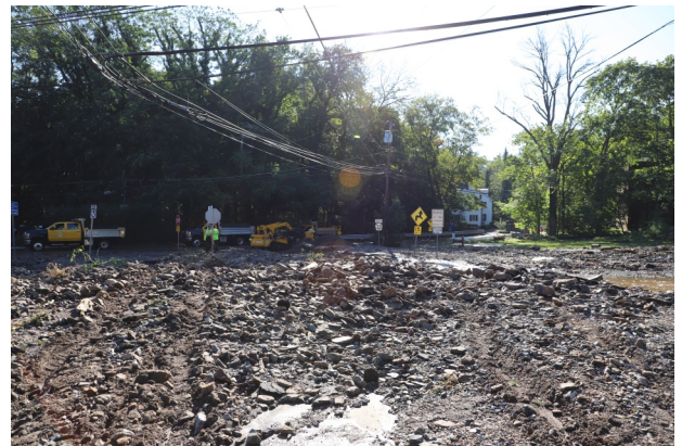
The scene along Center Bridge Road, September 2021.