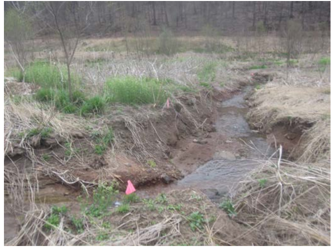
The erosion of the stream bank in some areas, evident in this recent photo from Aquetong Spring Park, will be repaired and stabilized through this spring's stream restoration project.

Pennsylvania Department of Environmental Protection and the U.S. Army Corps of Engineers. The project is funded by a $250,000 grant from the state Department of Conservation and Natural Resources, with an equal match from the Township.