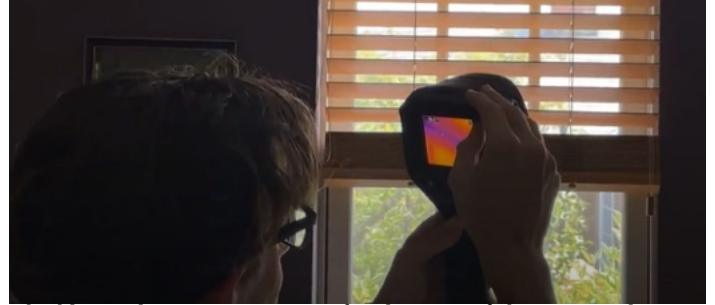
The blower-door test apparatus is fitted to one of the exterior doors in the Township Building (left). An infrared camera is used to detect any energy leaks around windows and doors (above).

expert insight, the Township will begin making plans to improve the energy efficiency of the municipal complex buildings and systems.