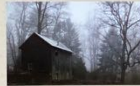
"Centre Bridge Canal"