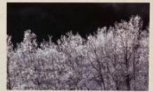
"Delaware River Winter"