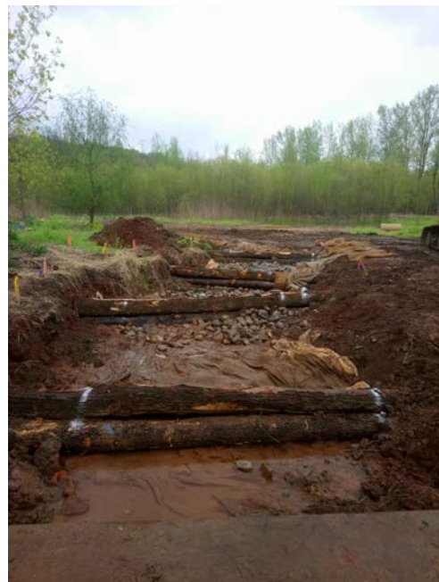
Step pools, constructed of large logs wrapped with geotextiles, help calm the stream flow.

The stream restoration project has secured all necessary approvals from the Pa. Department of Environmental Protection and