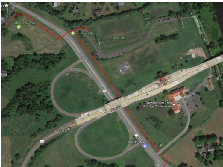
An aerial view of the Canal Park area, with the new trail path indicated in red. The completed project will create a new dedicated left-turn lane on River Road, add several curb ramps and crosswalks for safe access, and plant grass buffers between the trail and roadway traffic.