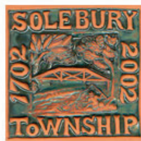
Series 3 & 4: Van Sant Covered Bridge, scenic Delaware Canal Bridge