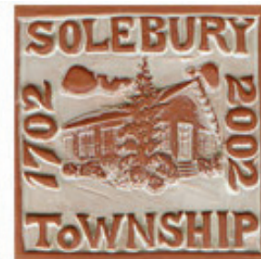
Series 1 & 2: The historic Columbus Oak, Solebury Village Stone School House